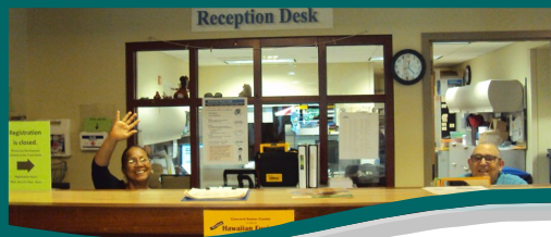
Our friendly reception area.

Friendly, outgoing and helpful are some of the characteristics we are looking for. These volunteers act as ambassadors for the senior center. You will teach visitors, guide class attendants, and direct the public.