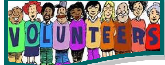
Volunteer come with a variety of skills and schedules.