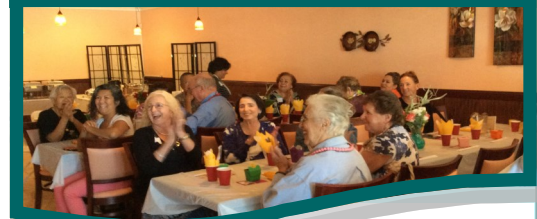
Appreciating our volunteers at our annual lunch.

There is no shortage of tasks. Sign up to be on the event committee, make decorations, event registration staff, preparations, cooking, cashier, security or cleanup.